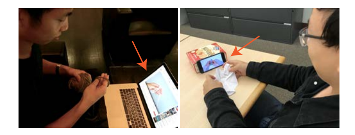
Figure 1: People use how-to videos to accomplish a variety of physical tasks. The person in the left photo is using the video on his laptop to learn how to stitch while the person on the right is attempting to fold an origami turtle by following the video on his phone. Since both of these are hands-on tasks, it would be difficult for these people to navigate the videos using traditional click or touch based input modalities.

ACM ISBN 978-1-4503-5970-2/19/05...$15.00 https://doi.org/10.1145/3290605.3300931