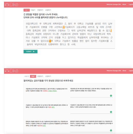
Figure 2: The split interface (top). A user can click boundaries between split. The polish interface (bottom). It shows how the user modify each sentence.

Finally, crowd can revise each complete sentences into more easy sentences. Written judgments normally contain multiple jargons, which hinders readability. Revising the sentences such as substituting jargon into more easy words or paraphrasing the whole sentence also enhance readability. The interface of revise phase is also same as that of polish phase.